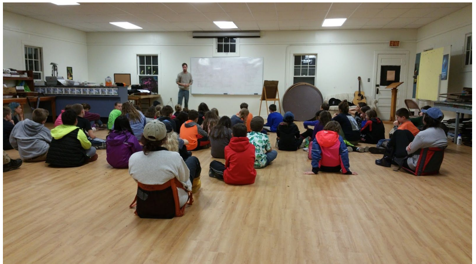
Fun at Nature's Classroom