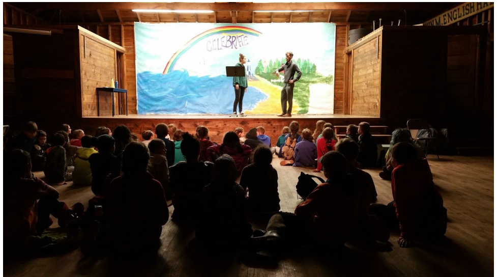
Talent Show at Nature's Classroom

Please drop off at the main office! Thank you!